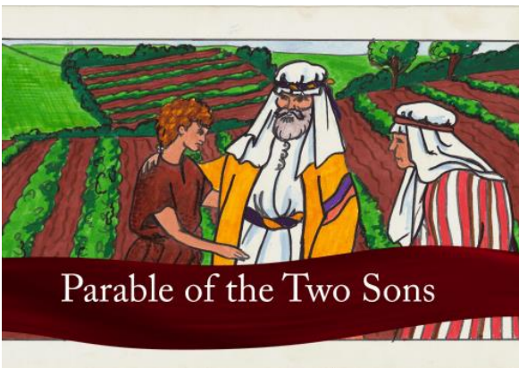
Parable of the Two Sons